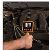
View brake/engine systems