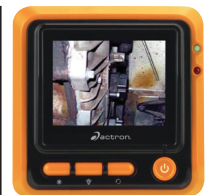
2.4" color LCD screen