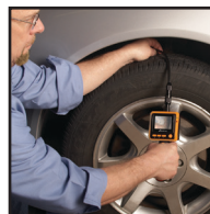
3ft. flexible camera tube