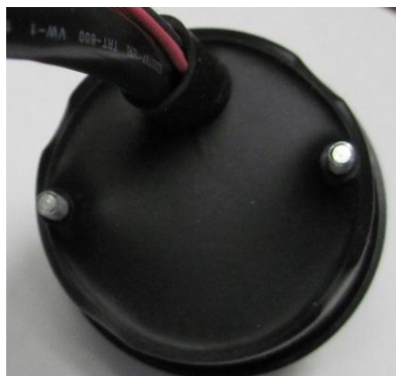
Figure 2. Installed Boot