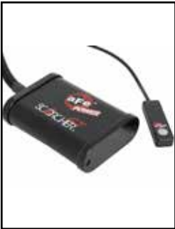
SCORCHER GT Module

P/N: 49-43091-B (Blk. Tips) 49-43091-P (Pol. Tips)