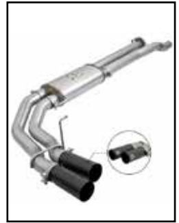
Side-Exit Exhaust System

P/N: 49-43091-B (Blk. Tips) 49-43091-P (Pol. Tips)