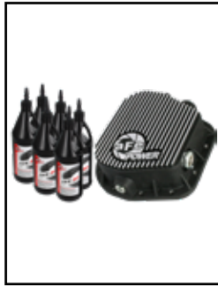
Rear Diff. Cover

P/N: 46-70152-WL (w/ Oil) 46-70152 (Blk, Mch) 46-70150 (RAW)