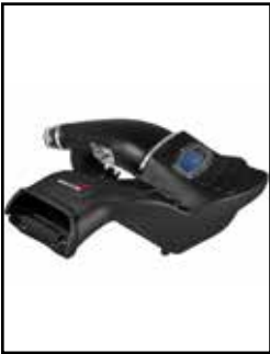
Cold Air Intake System