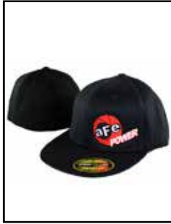
aFe Power Hat