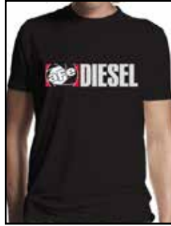
aFe Diesel Tee

P/N: 40-30221 (M) P/N: 40-30222 (L) P/N: 40-30223 (XL) P/N: 40-30224 (2XL) P/N: 40-30225 (3XL)