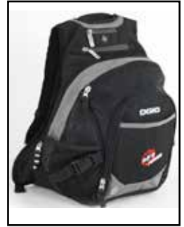
aFe Power Backpack

P/N: 40-30221 (M) P/N: 40-30222 (L) P/N: 40-30223 (XL) P/N: 40-30224 (2XL) P/N: 40-30225 (3XL)