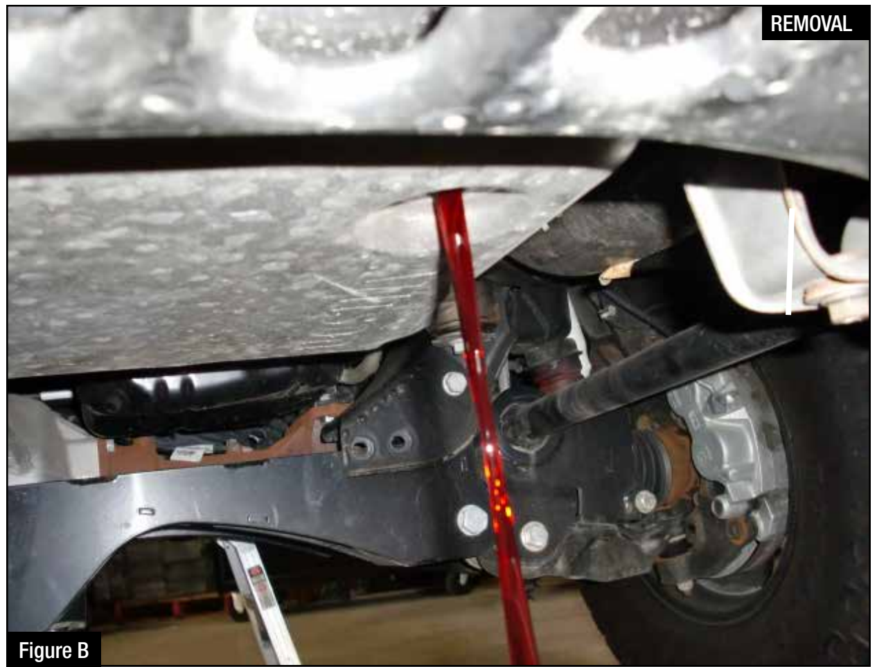
Refer to Figure B for Steps 3-4

Step 3: Begin by removing drain plug using a 15mm socket and drain the transmission fluid.