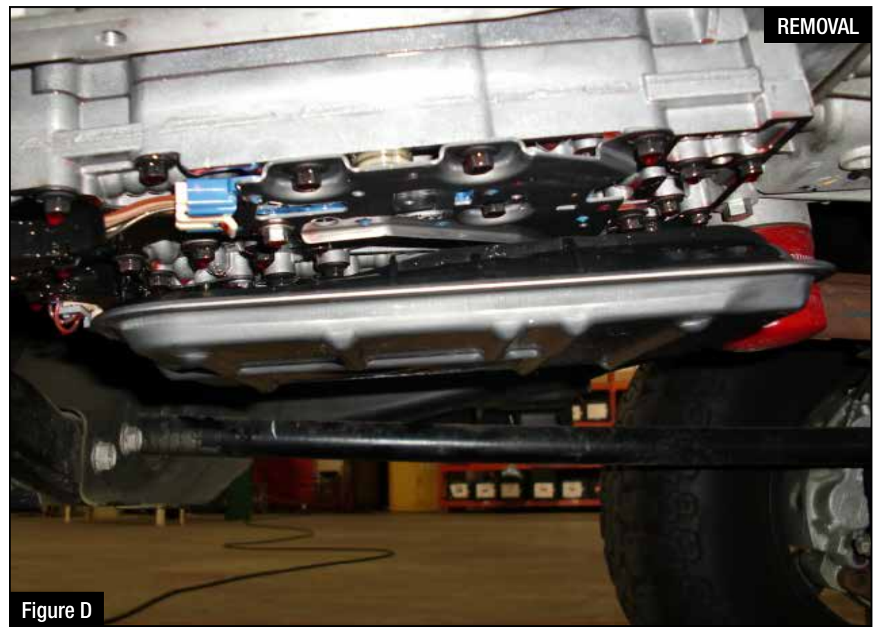
Refer to Figure D for Step 6