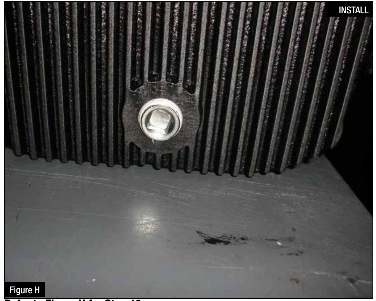
Refer to Figure H for Step 10