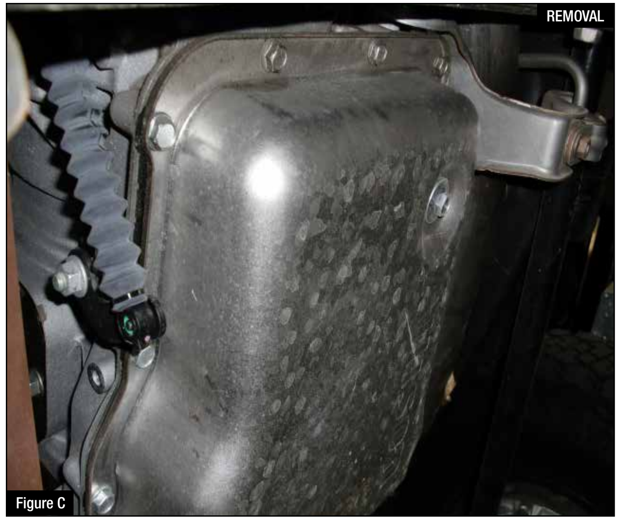
Refer to Figure C for Step 5

Step 5: Loosen the transmission pan bolts with a 13mm socket and remove the stock pan.