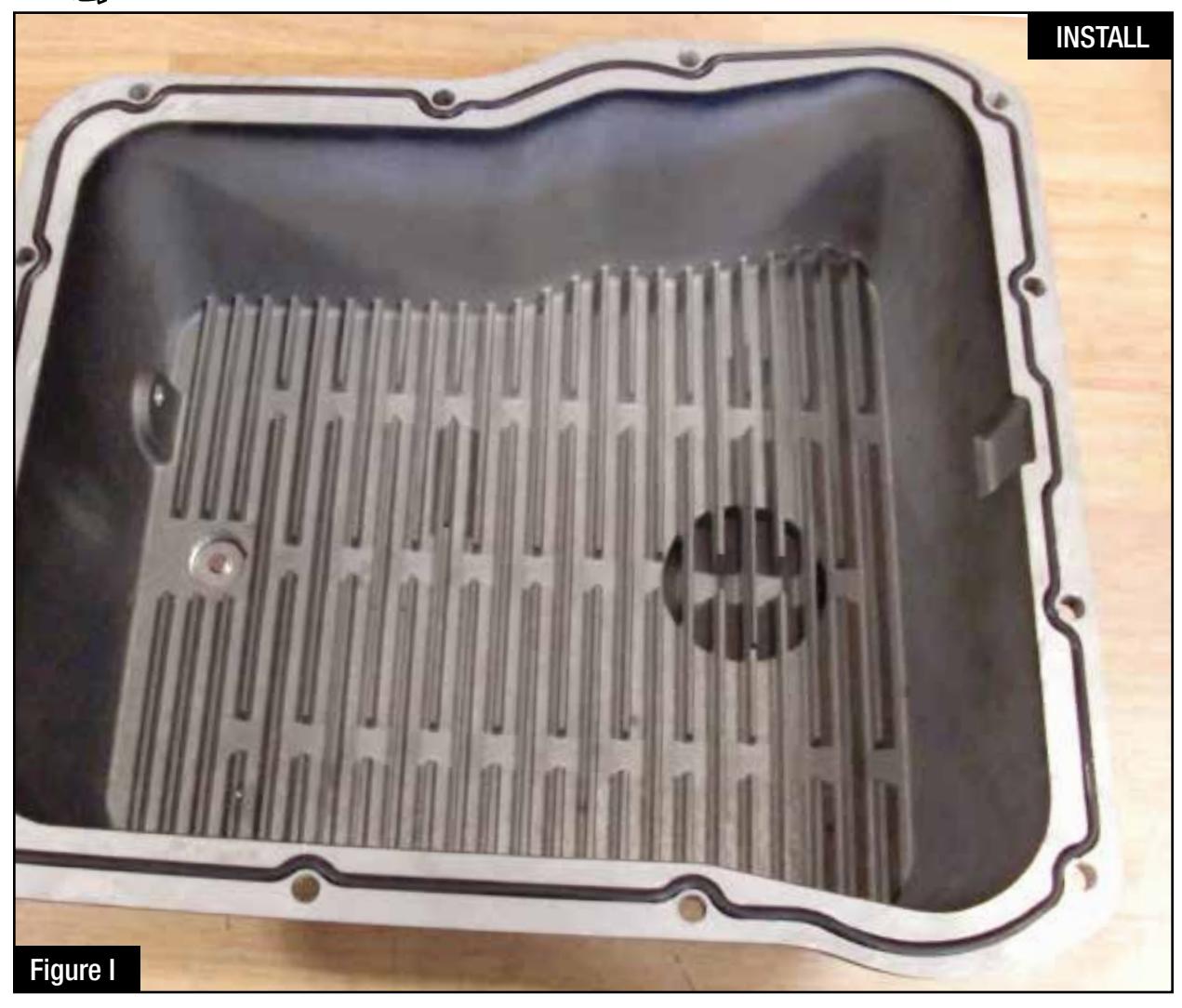
Refer to Figure I for Step 11

Step 11: Insert the o-ring into the o-ring grove.