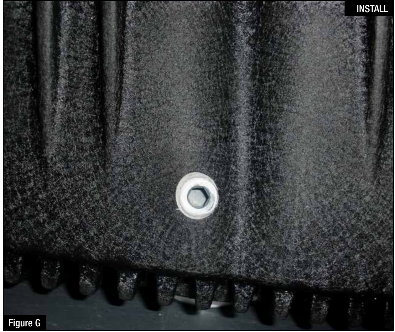
Refer to Figure G for Step 9

Step 9: If you have a temperature sensor skip this step. Install the 1/8" NPT plug using a 6mm allen wrench on the back of the aFe transmission pan (torque to 3 ft.-lbs.).