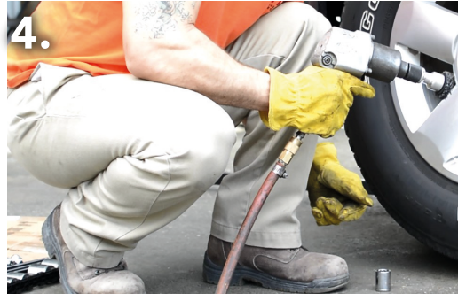
After the 37330 Hub Buddy XL is affixed securely make sure impact wrench is spinning in a clock-wise motion to insure that the disc remains secure during operation.