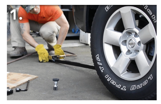
Lift the vehicle with jack in preparation to remove the tire. Secure the vehicle with stands or other approved equipment.