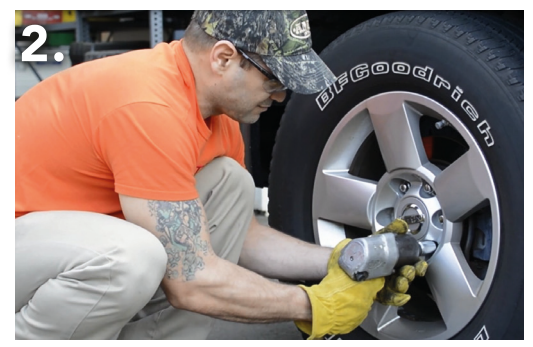
Remove lug nuts off wheel with impact wrench, normally.