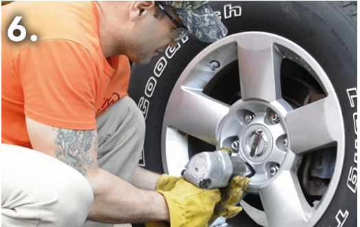
Once process is completed for all wheel mounting studs, remove the 37330 Hub Buddy XL attachment from impact wrench and replace with the socket. Place wheel and tire on hub and affix all lug nuts and process is complete.