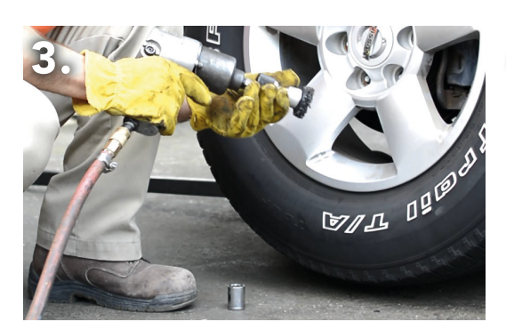
Remove the socket from the impact wrench and replace with the 37330 Hub Buddy XL.