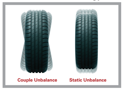
A unique balancing system (unbalance correction methodology) that minimizes both static and couple unbalance