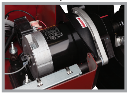
The motor and spindle are combined into a single, pre-balanced assembly that always stays calibrated to zero.