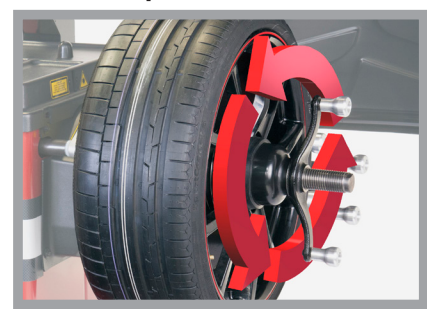
Provides the ability to thread the hub nut at the push of a pedal to improve the ease-of-use and speed of mounting the wheel

To learn more about the Coats 1600-3D Wheel Balancer, or any of our other quality products, contact your authorized Coats distributor or call 1-855-876-3864 for the dealer nearest you.