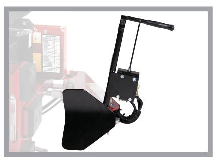
The Bead Loosener offers point of use controls to the technician, providing direct line of site, reducing the risk of wheel damage.