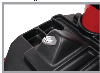
This feature concentrates air flow to seal the beads more efficiently and eliminates excessive maintenance.