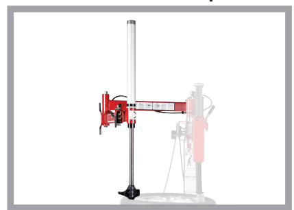
Device assists in efficiently changing low profile or run flat tires.