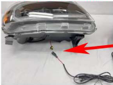
RIGHT (PASSENGER) HEADLIGHT

CONNECT A TO RIGHT HEADLIGHT CONNECTOR, AND B TO LEFT HEADLIGHT CONNECTOR AS SHOWN. THEN USE DOUBLE-SIDED TAPE ON PRE-INSTALLED RESISTORS TO TAPE THEM ONTO THE EMPTY SPACE OF SHEET METAL BEHIND HEADLIGHT SET.