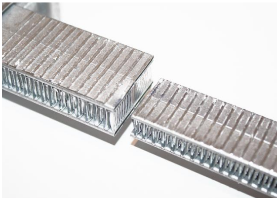
Narrower Core Depth