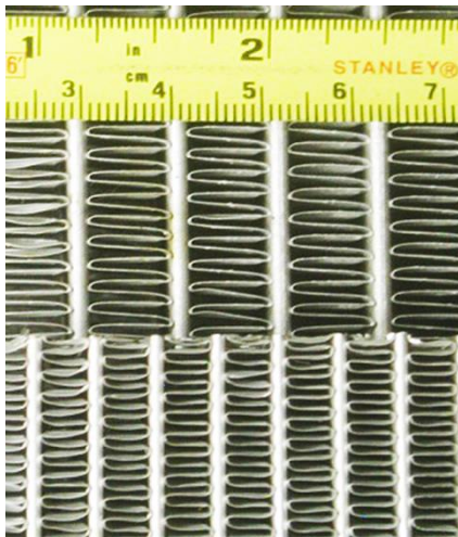
Increased Tube Quantity

High Efficiency Radiators are the newest technology in the automotive heat transfer industry. They incorporate the latest OEM designs in aftermarket replacement radiators to provide superior cooling performance than the old design being replaced. High Efficiency Radiators incorporate a narrower tube size, enhanced fin design, narrower fin height, and narrower tube centers. These design features allow us to increase the total amount of tubes and fins in the radiator core while decreasing the core thickness. The increased tubes and fins provide more cooling in a narrower core depth than the original while meeting or exceeding the OEM design it is replacing every time.