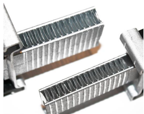
Enhanced Fin Design