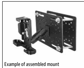
Example of assembled mount