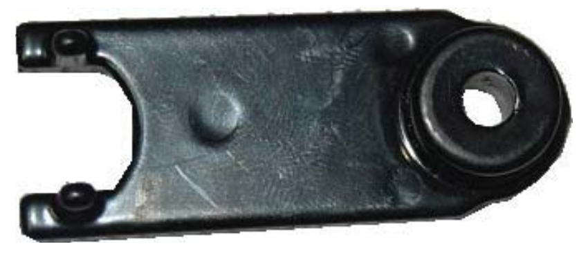
FORD FUEL LINE COUPLING TOOL

For 1990 & newer Ford Ranger & Explorer w/ 4.0L, 6 cylinder engines. Releases quick connect fittings on fuel rails.