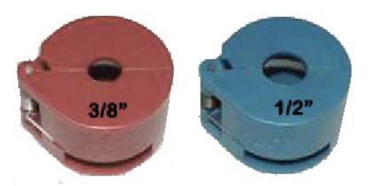
2PC FUEL LINE DISCONNECT TOOL -3/8", 1/2"

For 1988 & newer Ford F-Series trucks, Bronco, Ranger, Explorer; 1989 & newer Ford Thunderbird Mercury Cougar. Disconnects hydraulic clutch line from clutch slave cylinder.