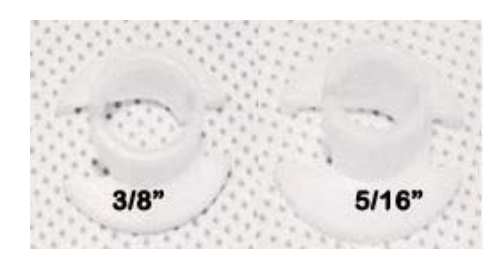
2PC FUEL LINE DISCONNECT TOOL - 5/16", 3/8"

For 1987 & newer Ford vehicles w/ spring lock connectors.