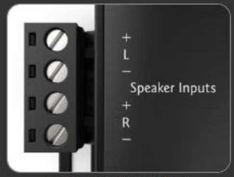
SPEAKER LEVEL INPUTS