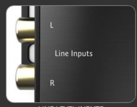
LINE LEVEL INPUTS