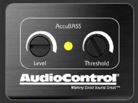
ACCUBASS® STATUS LED