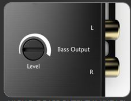
VARIABLE BASS OUTPUT (1 KHZ LP)