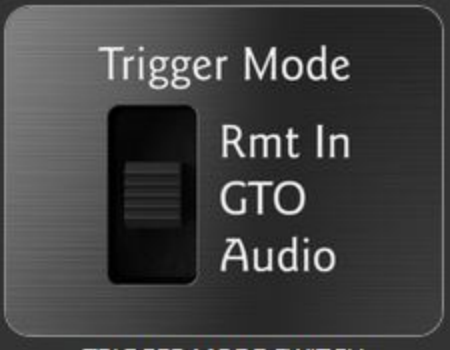
TRIGGER MODE SWITCH