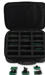
EXPANDED KEY PROGRAMMING ACCESSORIES