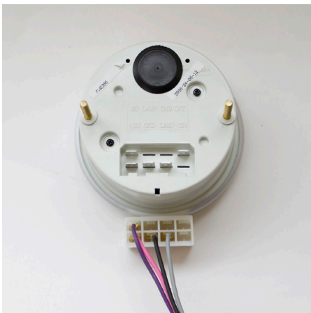
Electric Speedo with lower row terminals