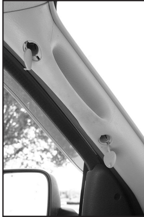
Dodge Ram Shown (Photo 1)