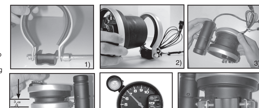
Note: Installation images shown may be different from your actual model.