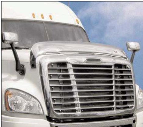
* Subject to terms and conditions on Next Gen Aeroshield warranty statement.

Get the hood shield truckers prefer – Belmor’s new Next Gen Aeroshield in chrome and smoke.