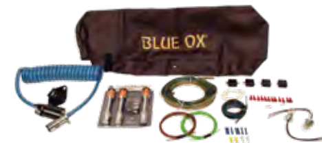
BX88308 7 to 6 Avail Accessory Kit • 7-6 wire electrical cable • Bulb and socket kit • 3-lock set • 4-diode kit • Tow bar cover