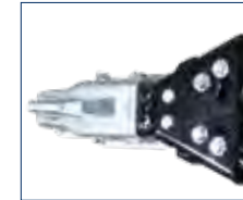
BX88248 Allure 2" Ball Adapter Shown installed.