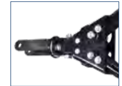
BX88250 Allure 2" Clevis Adapter Shown installed.