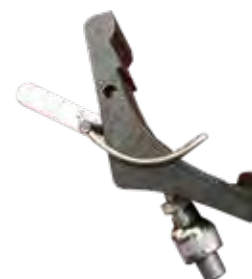
BRK2514 Patriot® II Adjustable Brake Claw for Fiat 500