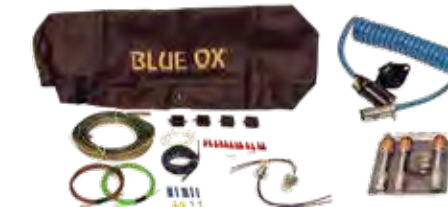
BX88341 7 to 6 Ascent Accessory Kit • 7-6 wire electrical cable • Bulb and socket kit • 3-lock set • 4-diode kit • Tow bar cover