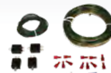
Diode Wiring Kit

Connects RV's tail, brake, and turn signal lights to towed vehicle's light system. Includes 26' long, 4-wire harness; 3 diodes; and detailed instructions. Diodes prevent electrical feedback.