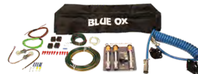
BX88229 Accessory Kit • Bulb and socket wiring kit • 6-wire coiled electrical cable • 3-lock kit and • Tow bar cover