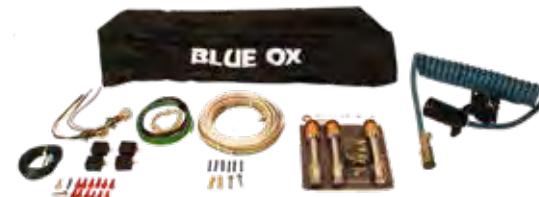
BX88231 7 to 6 Accessory Kit • 7-6 wire electrical cable • Bulb and socket kit • 3-lock set • 4-diode kit • Tow bar cover