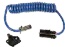
BX88206 7 to 6-Wire