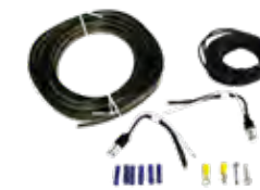
Red LED Taillight Wiring Kit

LED bulb & socket kits are brighter and smaller than bulb & socket kits, allowing for ease of installation in compact taillight housings. Do not tap into the vehicle's existing wiring & are operated by the towing vehicle.