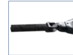
BX88249 Allure 2" Receiver Adapter Shown installed.