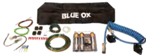
BX88229 Accessory Kit • Bulb and socket wiring kit • 6-wire coiled electrical cable • 3-lock kit and • Tow bar cover