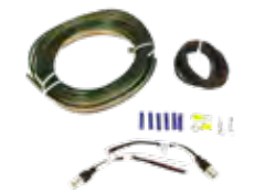
Clear LED Taillight Wiring Kit

LED bulb & socket kits are brighter and smaller than bulb & socket kits, allowing for ease of installation in compact taillight housings. Do not tap into the vehicle's existing wiring & are operated by the towing vehicle.