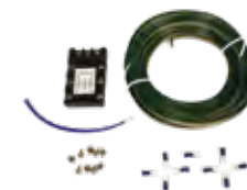
Taillight Wiring Kit

BX88334 4 Diode Kit with 50 OHM Resistor