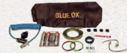
BX88341 7 to 6 Ascent Accessory Kit 7-6 wire electrical cable • Bulb and socket kit 3-lock set • 4-diode kit • Tow bar cover