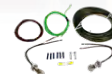
Bulb & Socket Taillight Wiring Kit

The bulb & socket kit does not tap into the vehicle's existing wiring. Fits most vehicles with clearance in taillight. Operated by the towing vehicle.