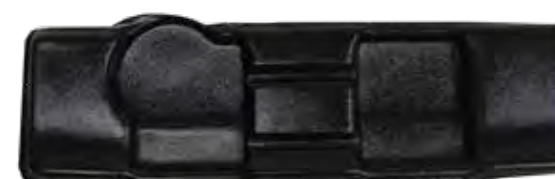
BRK2503 Patriot® II Seat Stiffener

Learn more about trailer hitches on our website.