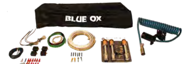
BX88231 7 to 6 Accessory Kit • 7-6 wire electrical cable • Bulb and socket kit • 3-lock set • 4-diode kit • Tow bar cover