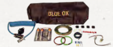
BX88308 7 to 6 Avail Accessory Kit 7-6 wire electrical cable • Bulb and socket kit 3-lock set • 4-diode kit • Tow bar cover