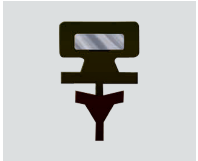
Previous Technology – Internal Tension Springs

All Bosch wiper blades utilize exclusive metal tension springs. They are specially tensioned for each blade length for consistent windshield contact. Bosch beam blades feature specific beam curvature for specialty wiper arm types. These innovative designs are engineered to give you crystal clear visibility and superior streak-free performance over a long service life.