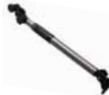
TELESCOPING SUPPORT BRACE -Provides Extra Support For Mobotron's In-Vehicle Laptop Mount