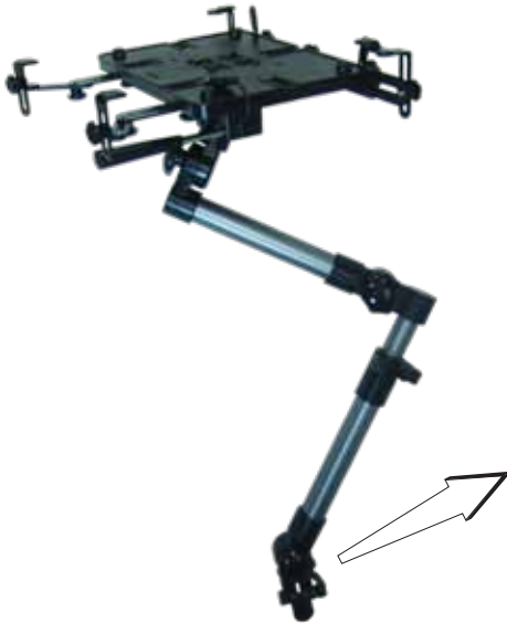
LAPTOP MOUNTING SYSTEM

Strong, sturdy construction with a sleek, professional look. Constructed from 30mm heavy-duty aluminum tubing and high-strength alloy locking joints. The mount can be adjusted to multiple angles to securely hold your laptop in the perfect working and viewing position for you.