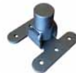
UNIVERSAL FLOOR MOUNT -Allows Mounting On Vehicle Floor