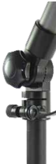
EASY ON EASY OFF