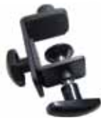
ADJUSTABLE C-CLAMP -Allows Easy Mounting of an LCD Monitor Display on a Desk