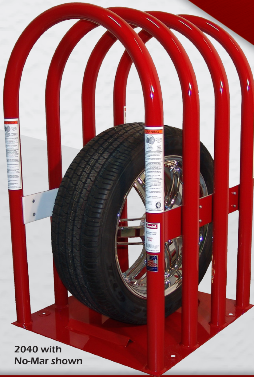
2040 with No-Mar shown