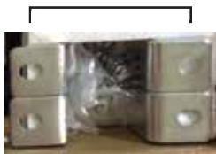
Mounting Bracket 3 5/8"

Single Cable: 220 Lb/33 Ft. Minute Double Cable: 440 Lb Lift 16.5 Ft. Minute Wired Control With 5 Ft. Cable High Carbon Steel 1/8 In. Thick Lines