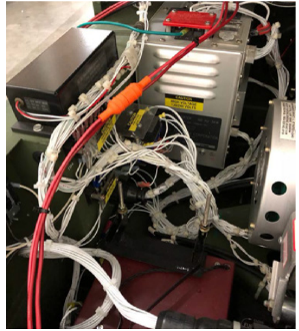
Figure 4. In-line fuse holder application

Environmental conditions : As mentioned in the circuit parameters section, environmental conditions must be considered as well. The most applicable would be the ambient temperature and any airflow, or lack thereof, provided by the environment. The laws of physics dictate that sources of resistance will result in energy losses, commonly in thermal energy or heat. Fuses and fuse accessories (and all current paths) have inherent resistances making them a heat source. The management of that heat can affect fuse performance (outlined in Technical Note 10483) so this needs to be considered. Better airflow or less restriction can help. This is more important to consider as the fuse and fuse holder sizing is closer toward the nominal current of the circuit. Also, the more enclosed a fuse holder is, the more heat will be trapped.