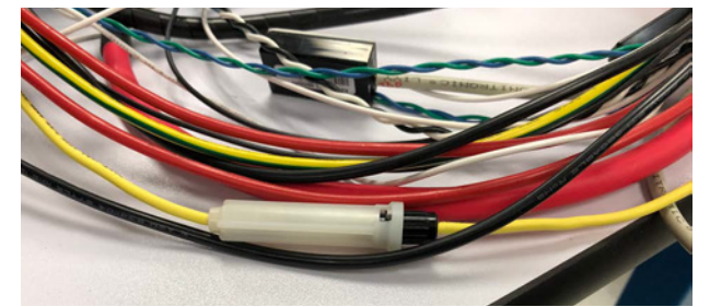
Figure 2. In-line fuse holder

Accessibility/Replaceability: During normal operation and after an overcurrent event is properly managed by the opened fuse, this brings two points of consideration: fuse accessibility and how easy it is to replace the fuse to regain operation. Fuse accessories can provide an easy way to change a fuse, as well as provide protection for people against electrical hazards interacting around the equipment in which it is installed. There are a couple different ways of defining this protection, sometimes referred to as Shock Safety, namely in IEC60127-6 or UL4248/IEC60529. It is very important to provide protection against electrical hazards, especially as voltages increase. While this is important, a designer also should consider how easy it is to replace the fuse and who can perform such functions. An end user of this equipment may prefer more difficult access to this fuse for electrical safety or easy access due to limited exposure to untrained persons. For more information on proper fuse replacement, please see Appendix or the Bussmann Series SPD