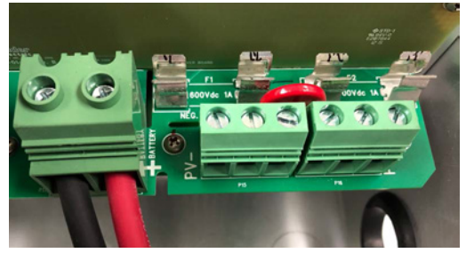
Figure 3. 600 Vdc PCBA with fuse clips

Practically speaking, creepage and clearance of different circuit voltage levels should be considered in the application to reduce the conditions of acceptability not typically known to users in the field since fuse holders are often mounted in metal enclosures. Eaton does not recommend assuming that published voltage ratings can be field installed as such.