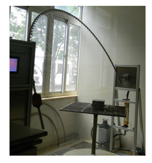
Figure 3. HTB panel mount fuse holders mounted in enclosure and tested to IPx3 conditions at 60 degrees from horizontal