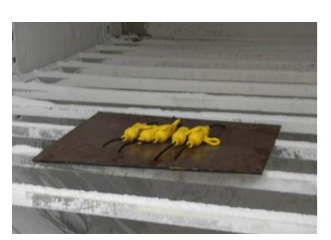
Figure 1. HFB-R with specified wire, installed per specification, tested under IP6x test conditions