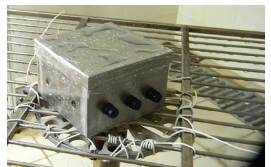
Figure 5. Testing for IP ratings on Eaton's HKP-W-R fuse holders

Other environmental considerations can be outside the electrical circuit itself, such as solid and/or liquid interactions with dust, water drops, equipment washing, complete water immersion, or other ambient conditions. Fuse holders may be capable of providing additional protection not otherwise provided by an enclosure to ensure these harmful contaminants do not interfere with the circuit path. Eaton has a group of fuse holders specifically evaluated to IEC 60529, which established ingress protection (IP) ratings, in order to allow easy understanding of environmental protection offered within the Bussmann Series portfolio. For more information, please see Technical Note 10709.