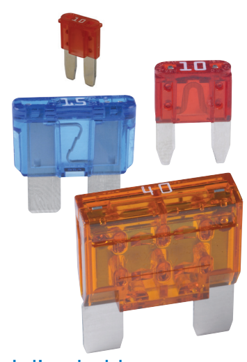
Inline holders are available for ATR, ATM, ATC and MAX blade fuses