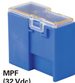
MPF (32 Vdc)