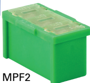
MPF2 (58 Vdc)

Bussmann series multi-pole fuses offer service technicians and DIYers a convenient, alternative source to car dealerships and online websites.