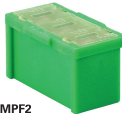
MPF2 (58 Vdc)