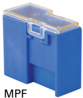
MPF (32 Vdc)