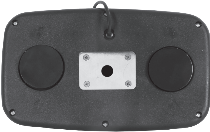
Magnetic Mount Ready