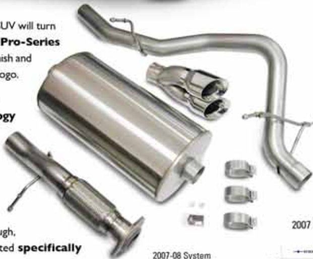
2007-08 System Shown Here