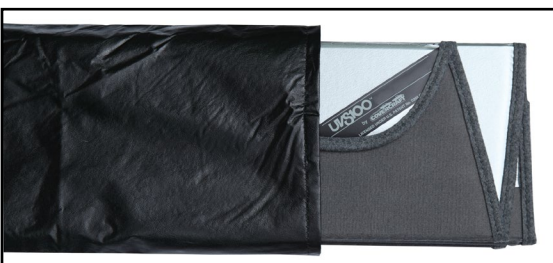
(Optional storage bag shown)

Pull down each sun visor to hold the UVS100® Custom Sunscreen in place. In some cases, the Sunscreen may not reach all the way to the windshield pillars. This additional space is necessary to be able to install the Sunscreen without damaging it.