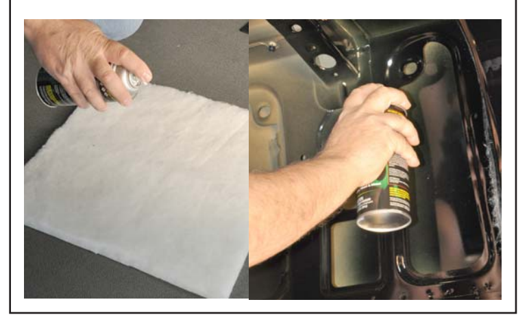
When it comes to quality interior parts, Design Engineering is the brand you can depend on.

The adhesive spray is a tack type adhesive. Both surfaces that are to be mated should be sprayed, left to tack for 30 to 45 seconds, then adhered together.