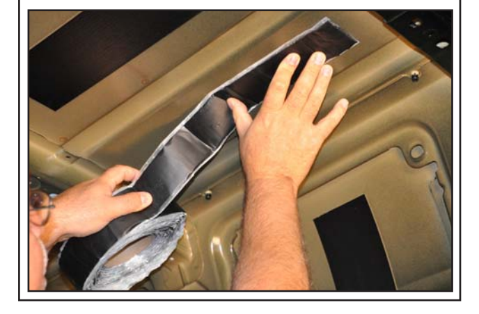
NOTE: Use damping tape for small areas. Cut in strips to add to other roof panels

STEP 9. Apply the remaining damping material in any flat areas of metal throughout the van interior. You do not need full coverage of damping material in these areas.