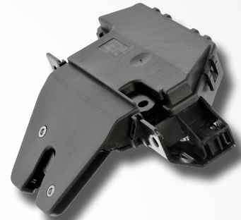
937-866 BMW 2013-99