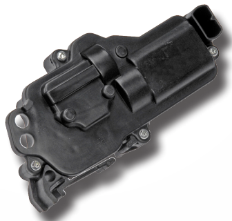
746-149 Ford 2010-98, Lincoln 2010-03, Mazda 2009-99, Mercury 2009-99