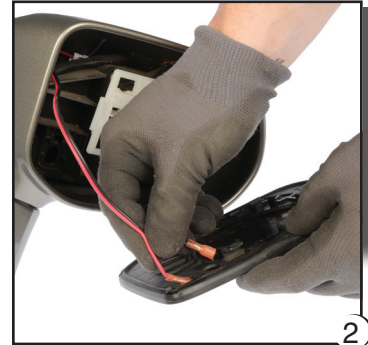
Fig. 2. Reconnecting the mirror glass assembly. A. If vehicle has a heated mirror, connect the wires to the heater terminals.