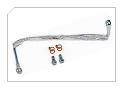
TURBOCHARGER FEED AND RETURN LINES