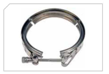
V-BAND EXHAUST CLAMPS