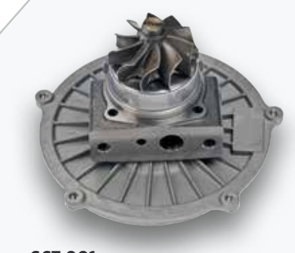
667-001 Ford 2003-99 VIO: 810.000+