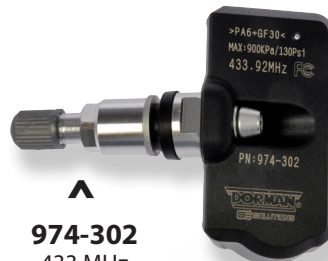
974-302 433 MHz MULTI-FIT Sensor