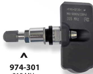
974-301 315 MHz MULTI-FIT Sensor