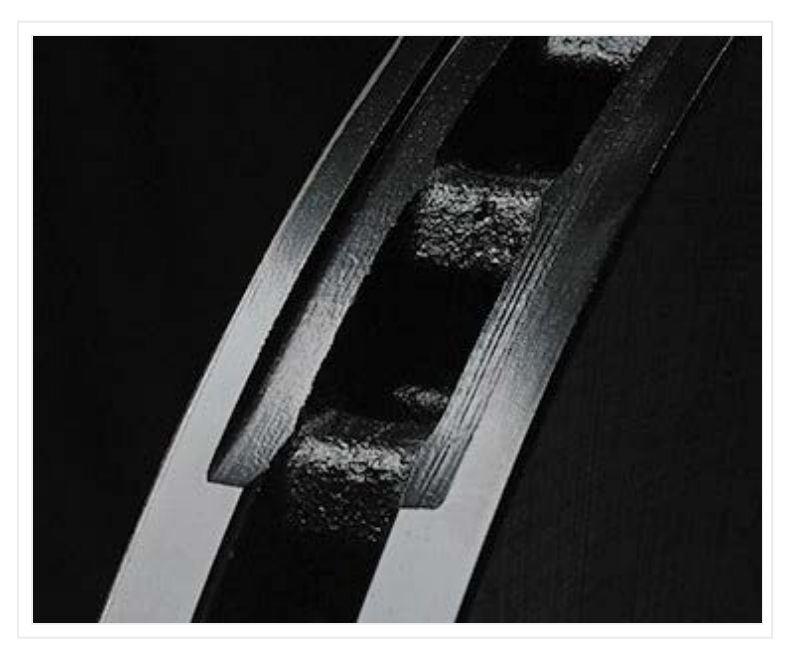
DuraGo Electrophoretic Rotors are 100% mill balanced for optimum braking performance.

DuraGo Electrophoretic process deposits onto all exposed surfaces, protecting the rotor both inside and out.