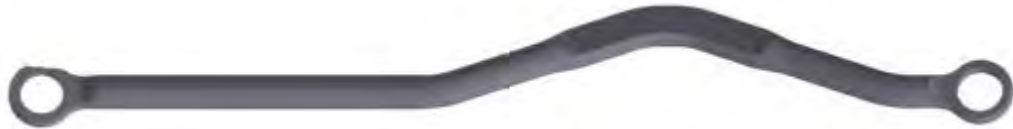
Track bar frame end