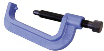
TORSION BAR UNLOADING/LOADING TOOL