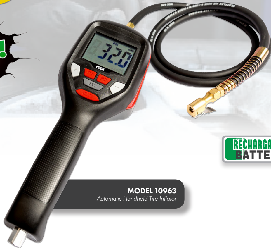
MODEL 10963 Automatic Handheld Tire Inflator