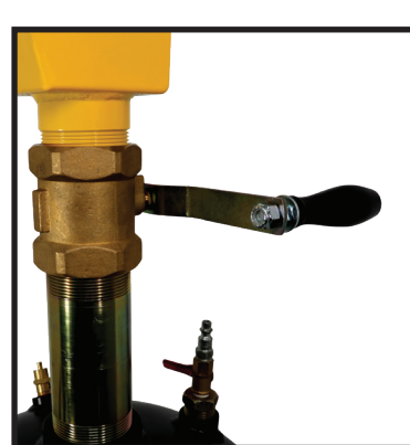
Push Handle designed butterfly release valve releases air fast and with precise accuracy