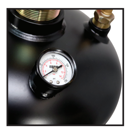
Air Gauge is designed for accurately filling of tank and is highly visable.

All Bead Seater Tanks are Covered by a 1-Year Warranty Against Manufacturer Defects