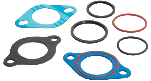
Water Outlet and Thermostat Gaskets

Water pump gaskets should be replaced when the water pump is being serviced. These gaskets are included in many Timing Cover Sets (TCS), but are also available separately. They are typically made of proprietary Blue Stripe® high-density, high-quality paper material. Their density balances good internal sealability, wick resistance, and conformability. Water pump gaskets are listed separately in the Fel-Pro catalog entry.