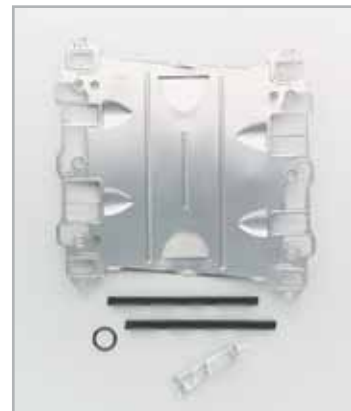
Fel-Pro Intake Valley Pan Set