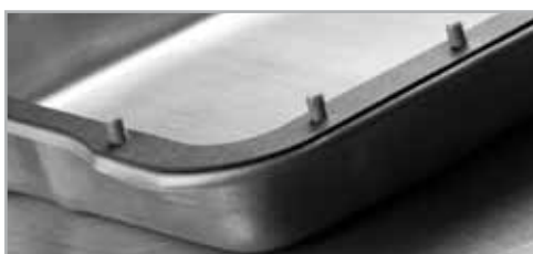
Hole-Locks® in action