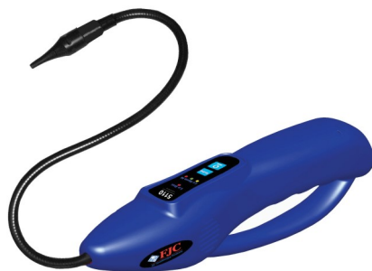
Part # 5110 FJC Electronic Leak Detector

WARNING: We warranty this product to perform as stated in these directions. As we cannot control the use of this product, the guarantee shall not exceed the purchase price. We make no other warranty of any kind expressed or implied. All warranties expressed or implied including warranties on merchantability and fitness of purpose are null and void if the equipment is altered, damaged or misused in any way or if equipment is not repaired by authorized repair station using authorized parts.