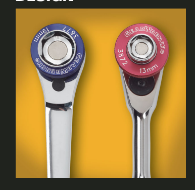
Fits both GearRatchet<sup>™</sup> and 3/8" drive ratchets.