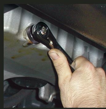
Fits most metric drain plug applications.