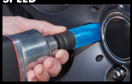
Protective outer sheath prevents damage to expensive wheels and lug nuts allowing you to work effectively.