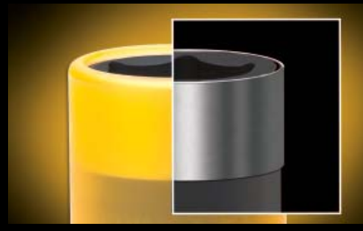
High-strength reinforcing ring increases durability, delivering up to 3X longer life than regular thin wall sockets.*