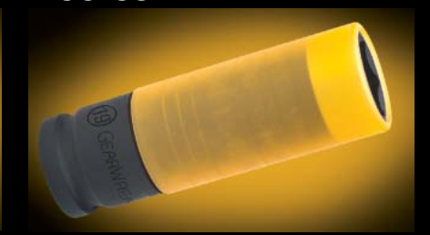
Thin wall socket design provides access in confined

The GearWrench High-Strength Wheel Protector Sockets deliver 3X longer life than regular thin wall sockets, providing durability, reducing downtime and preventing damage to expensive wheels and lug nuts.