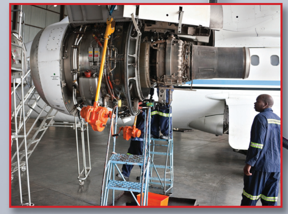
An articulating probe is a must for inspecting densely packed aircraft engines