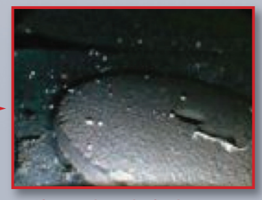
After pressing anti-reflection button (with mirror)

The anti-glare function of a VGA resolution probe