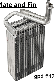
Plate and Fin