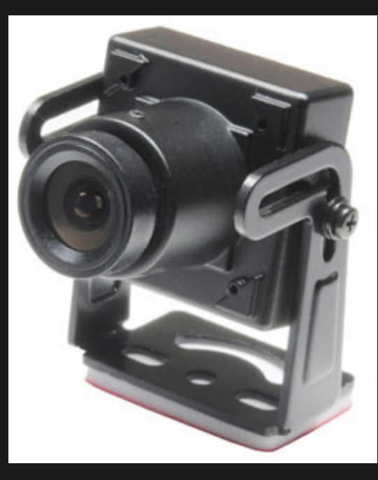
Second Camera (Standard Equipment) SONY CCD canera(24x24x27)